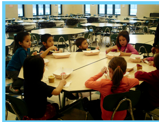
Learning to Eat in the Cafeteria